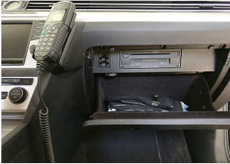
Port is located behind the stereo system