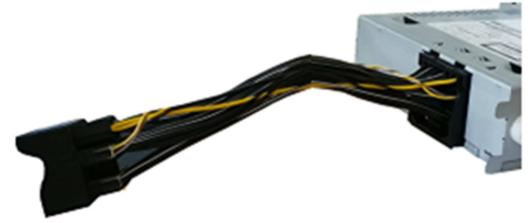
Connect the supplied plug & play cable set between radio part and original cable set