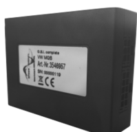
O.B.I complete 3546912