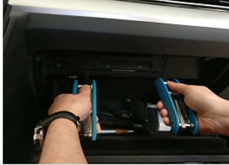
Remove radio part