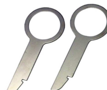
Radio unlocking tool