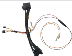
Cable set O.B.I complete C-3546912